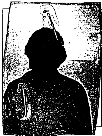
Photograph of alien removed